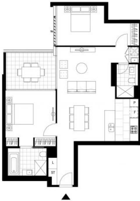
LEVEL 2, 3, 4, 5, 6, 7