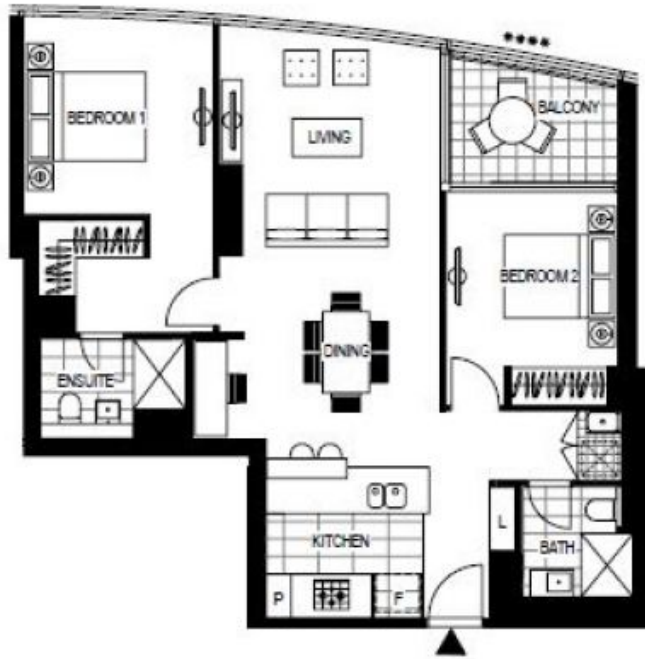
LEVEL 9, 10, 11, 12, 13, 14, 15, 16, 17, 18, 19, 20, 21, 22, 23, 24, 25, 26, 27, 28, 29, 30, 31, 32