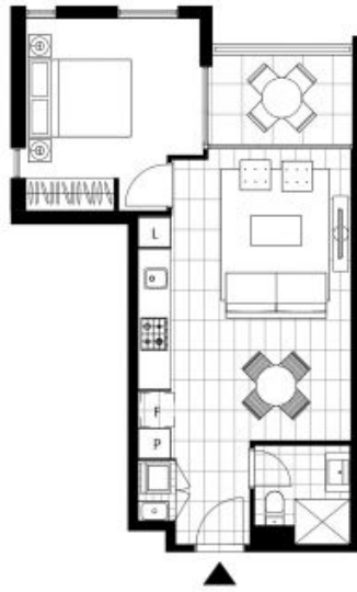
LEVEL 4, 5, 6