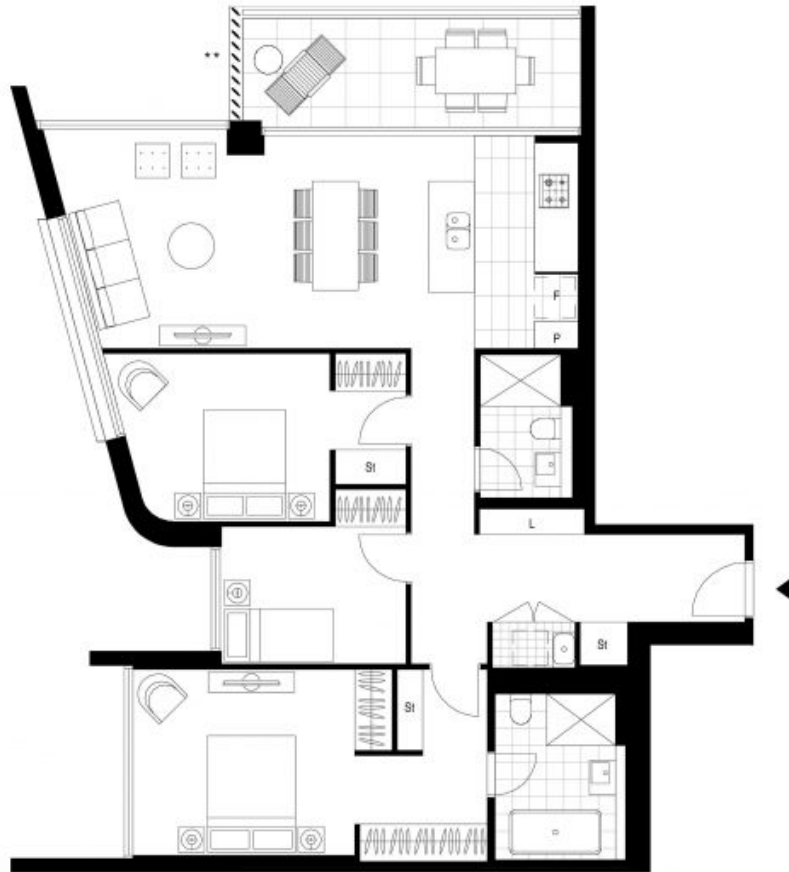
LEVELS 15-22 & 27

LOT No - 104 113 122 131 140 149 158 167 212