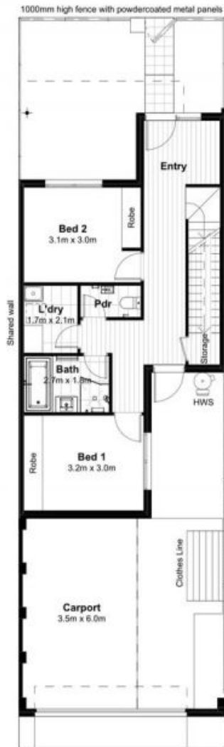
Ground Floor 1:100