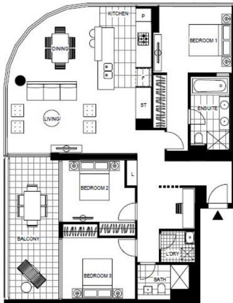
LEVEL 4, 5, 6