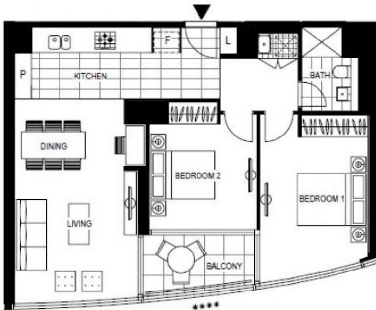
LEVEL 33, 34, 35, 36, 37, 38, 39, 40, 41, 42