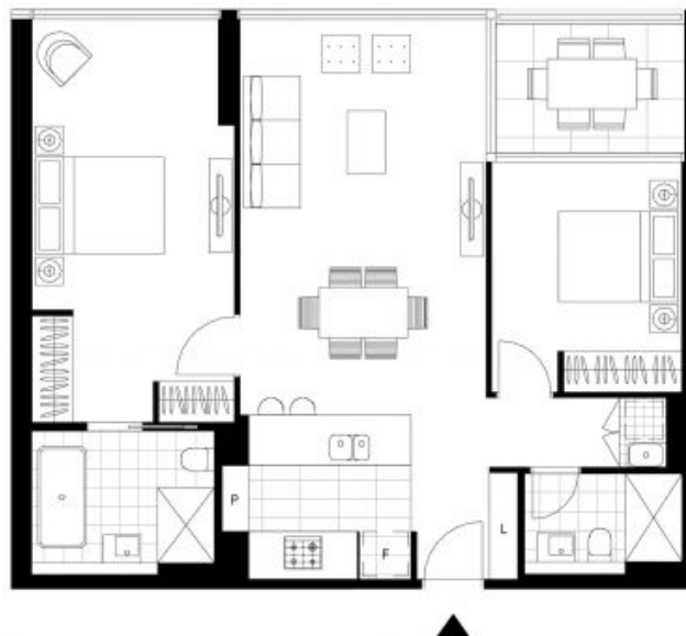
LEVELS 15 - 33

LOT No - 135 225 144 234 153 243 162 252 171 261 180 270 189 279 198 288 207 297 216