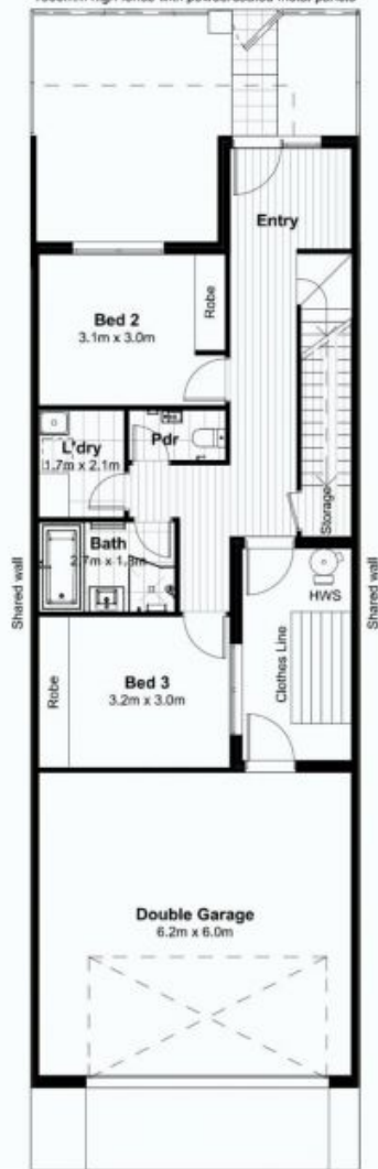
Ground Floor 1:100

1000mm high fence with powdercoated metal panels