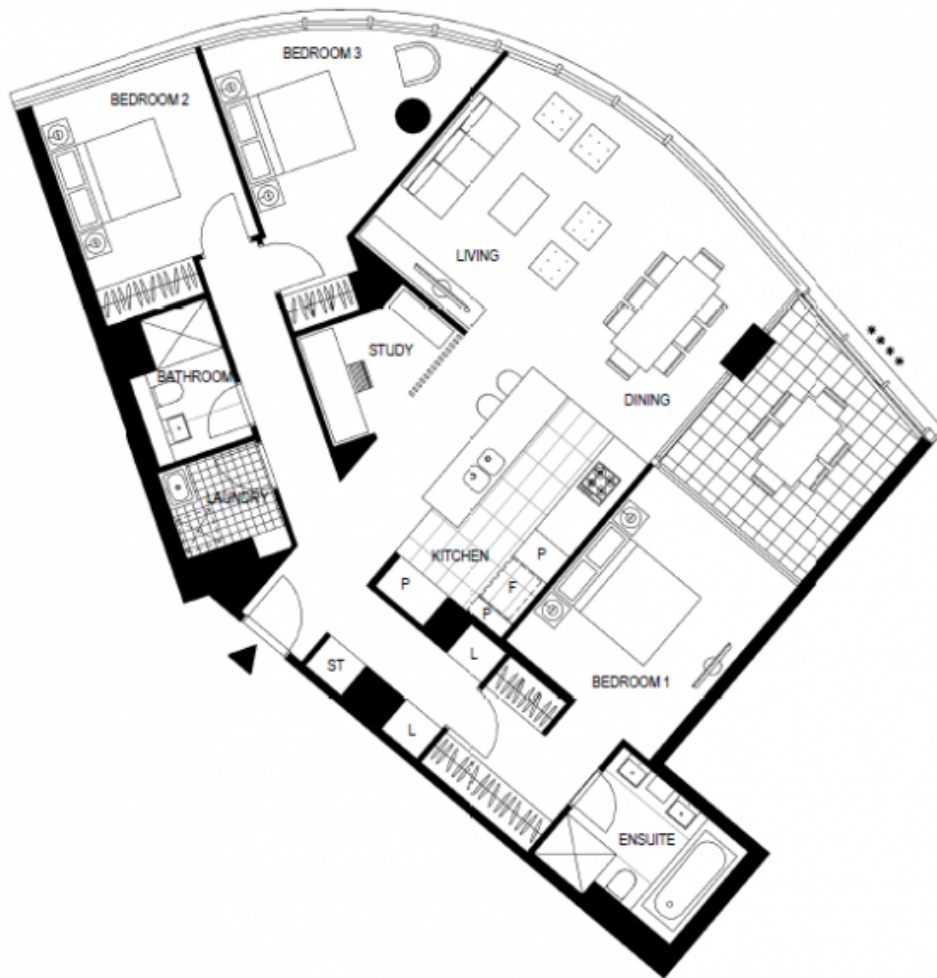
LEVEL 8, 9, 10, 11, 12, 13, 14, 15, 16, 17, 18, 19, 20, 21, 22, 23, 24