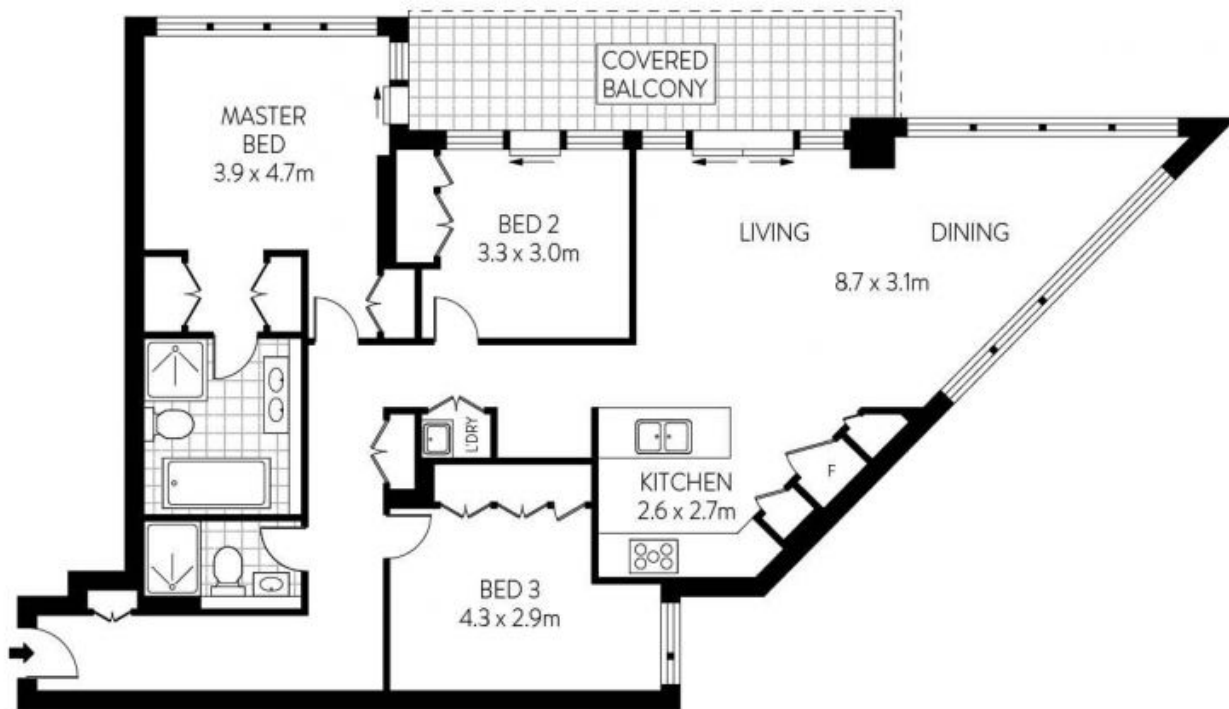
LEVEL TWENTY FOUR