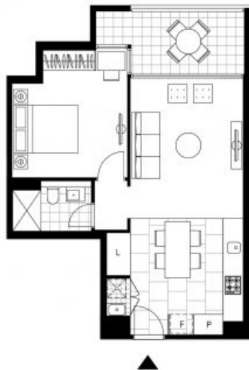
LEVEL 3, 4, 5, 6, 7