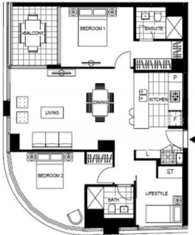
LEVEL 4, 5, 6