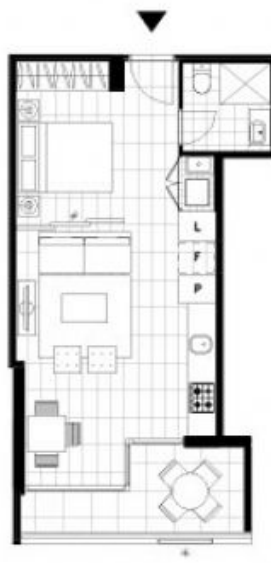
LEVEL 4, 5, 6