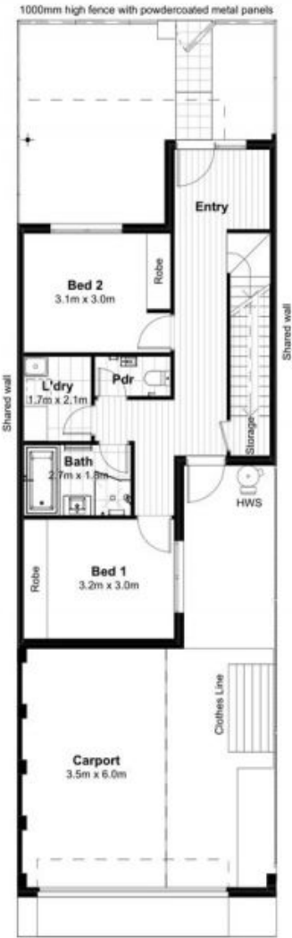
Ground Floor 1:100