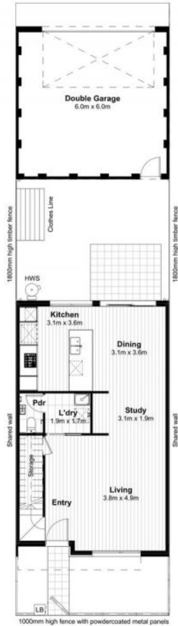
Ground Floor 1:100