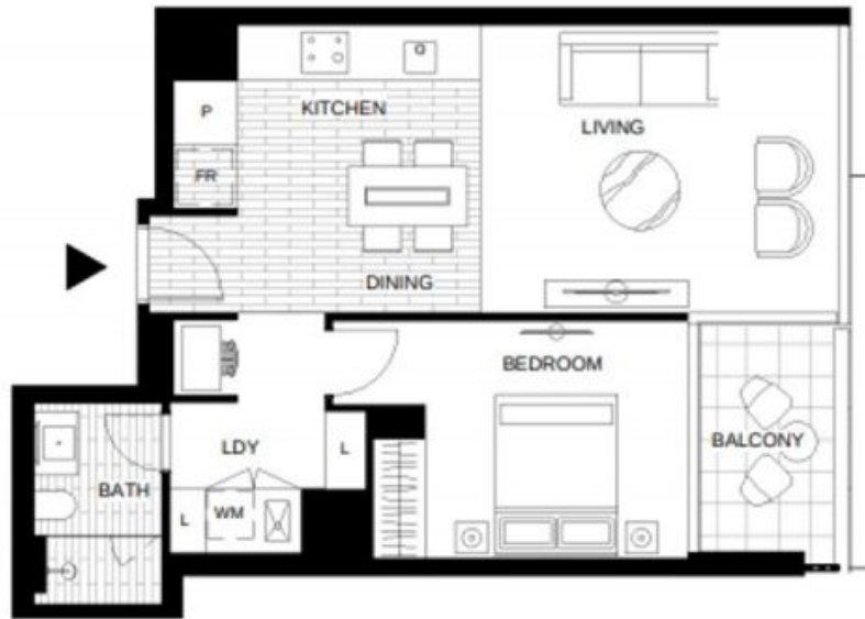
LEVEL 8V, 9V, 10V, 11V, 12V, 13V