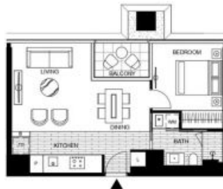
LEVEL 6, 7