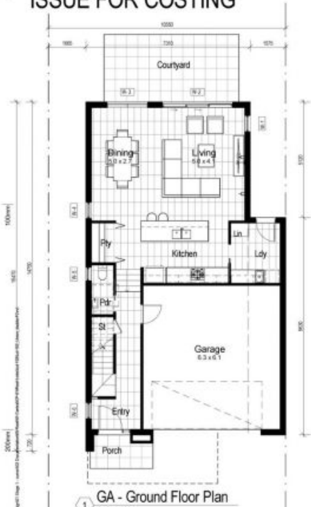
1 GA - Ground Floor Plan Scale: 1:100