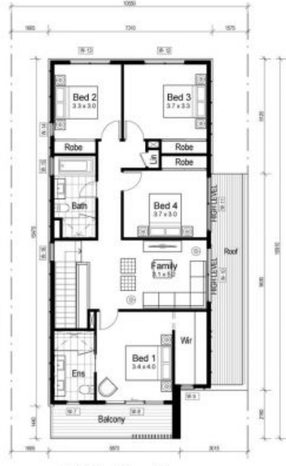
2 GA - First Floor Plan Scale: 1:100

Date: 10/22/15 Rev: A Author: ISSUE FOR COSTING - G2C Stage 1 Rev: B Author: REDUCE WINDOW SIZES TO REDUCE Rev: C Author: REVISUE FOR COSTING - F2C Stage 1, WINDOW SCHEDULE ADDED Project: EASTERN GOLF COURSE XX Stage 1 Client: Mirvac Design Address: Lot 102, 219E-DF4A-V City: Doncaster State: Victoria Country: Australia Scale: 1:100 Date: 10/22/15