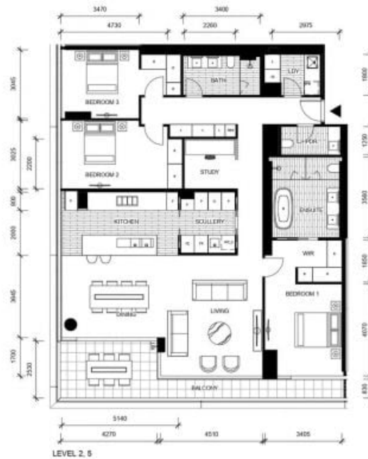
LEVEL 2, 5