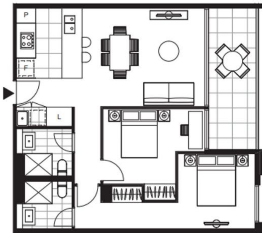
LEVEL 02, 04