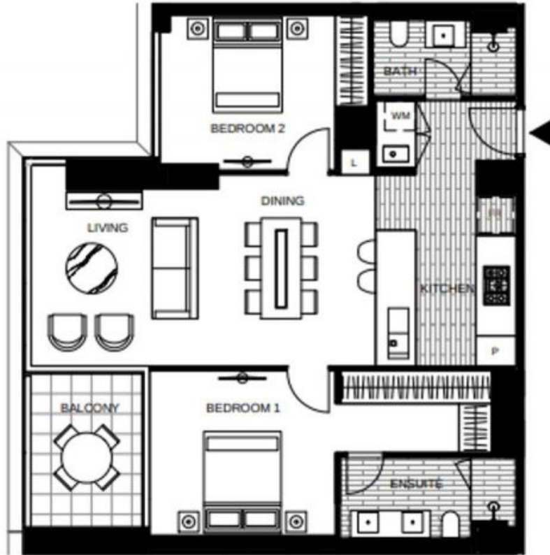
LEVEL 3, 4, 5, 6, 7, 8