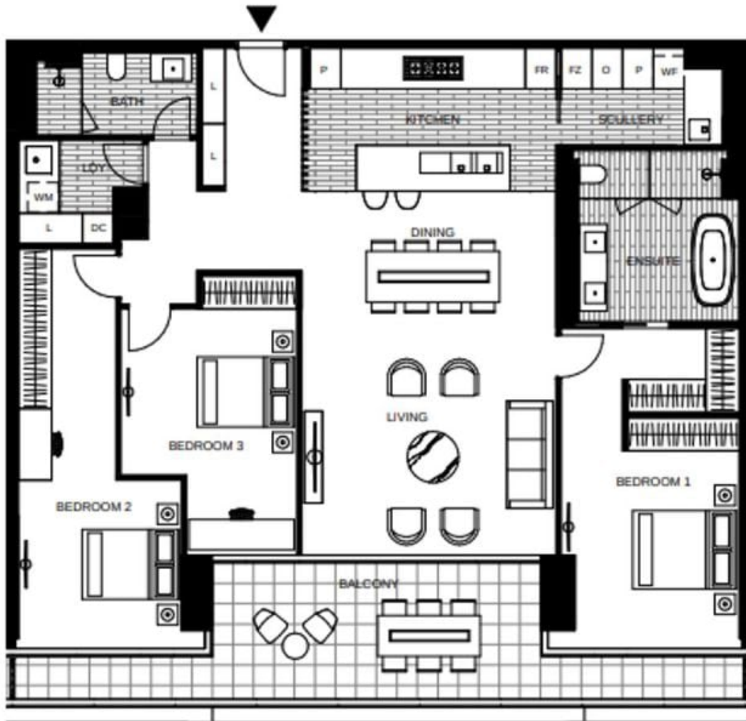
LEVEL 2, 3, 4, 5