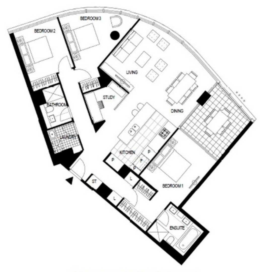
LEVEL 8, 9, 10, 11, 12, 13, 14, 15, 16, 17, 18, 19, 20, 21, 22, 23, 24