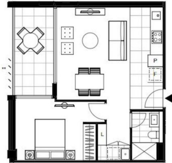
LEVEL 02, 04