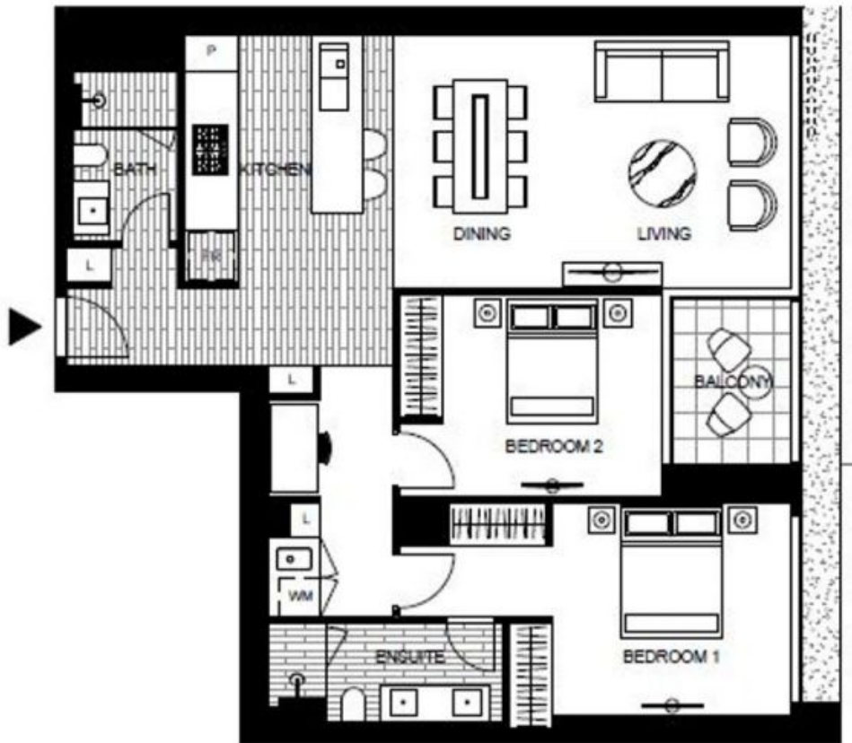
LEVEL 2, 3, 4, 5