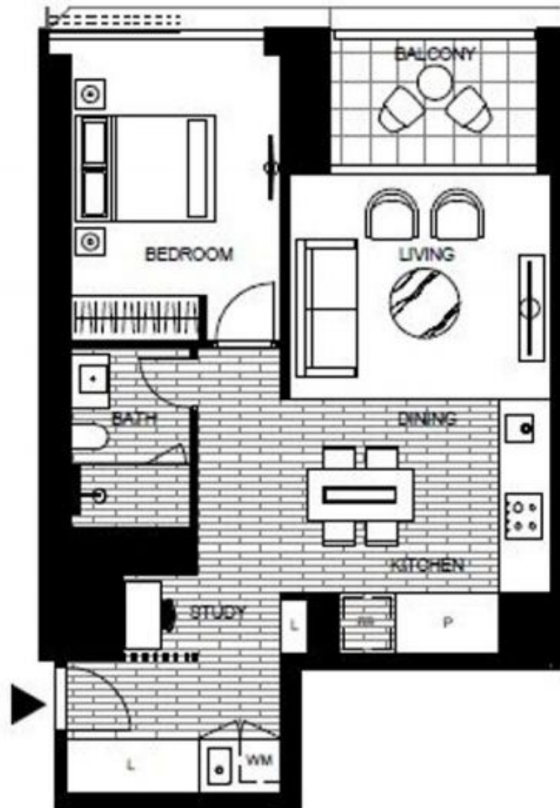
LEVEL 2, 3, 4, 5, 6, 7, 8