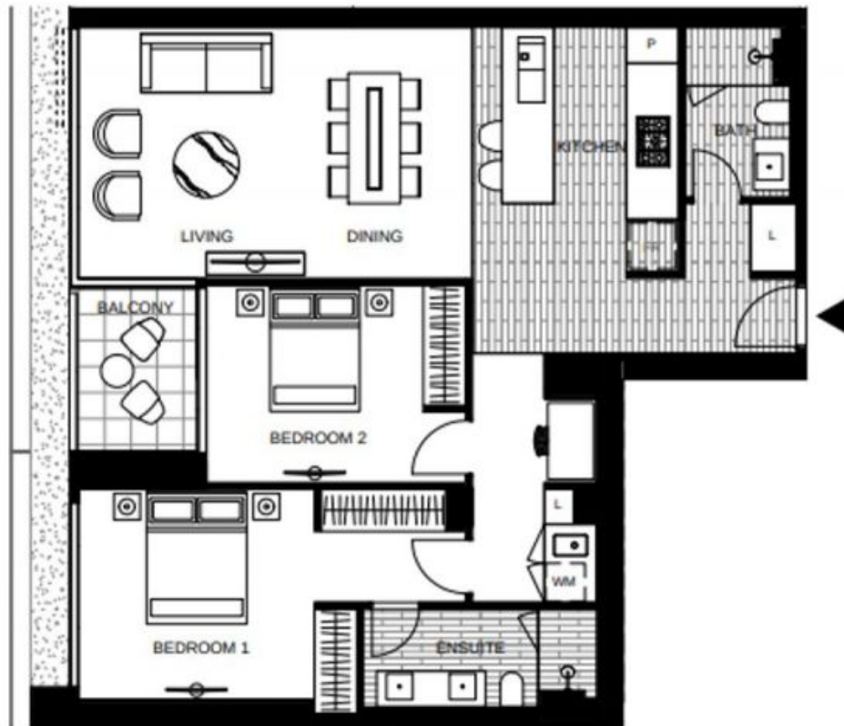
LEVEL 2, 3, 4, 5