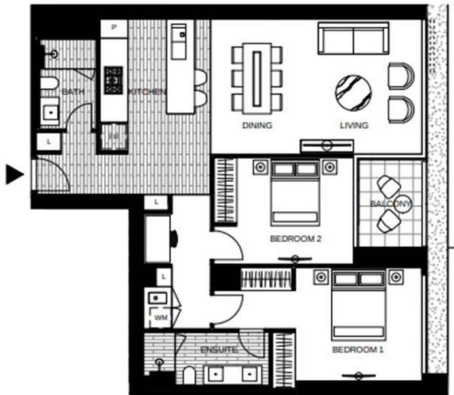
LEVEL 2, 3, 4, 5