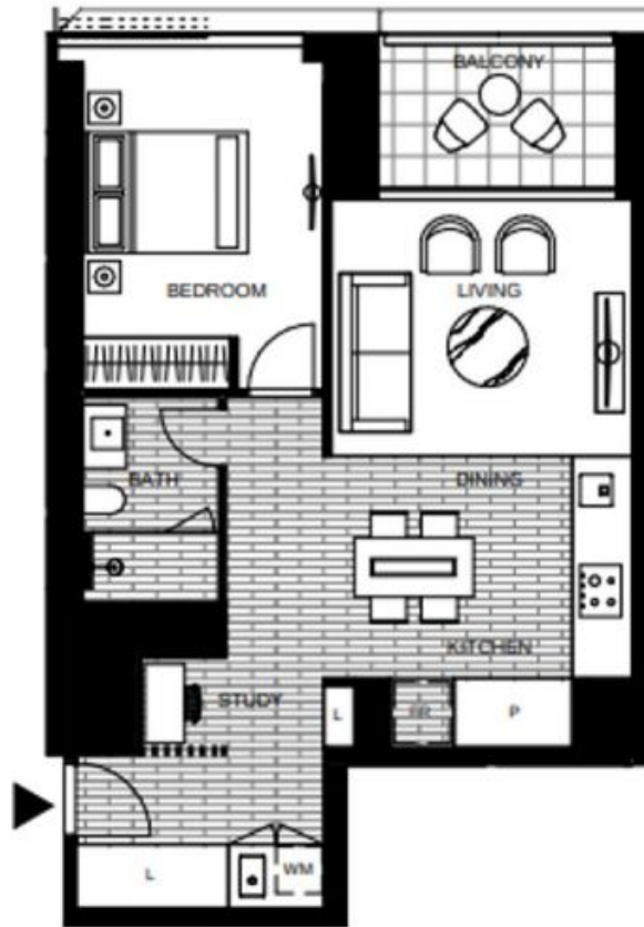
LEVEL 2, 3, 4, 5, 6, 7, 8