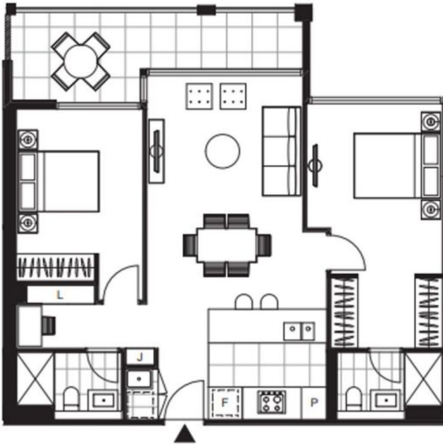
LEVEL 02, 04