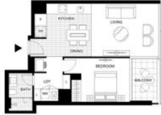
LEVEL 8V, 9V, 10V, 11V, 12V, 13V