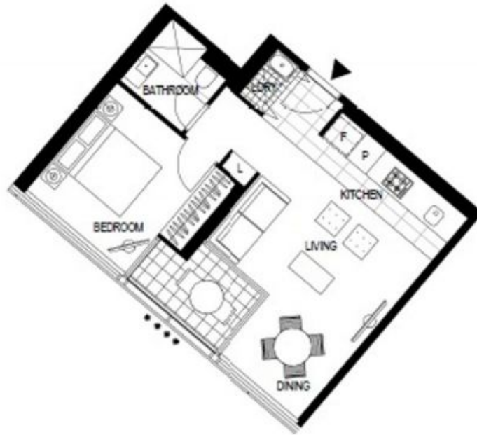
LEVEL 8, 9, 10, 11, 12, 13, 14, 15, 16, 17, 18, 19, 20, 21, 22, 23, 24