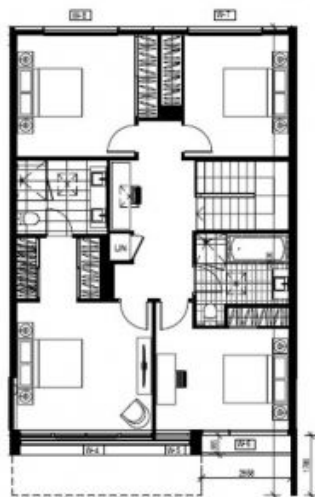
2 GA - First Floor Plan Albert B_F2 Scale: 1:150