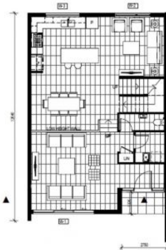
1 GA - Ground Floor plan AlbErt B_F2 Scale: 1:150