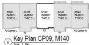
5 Key Plan CP09, M140 Scale 1:500