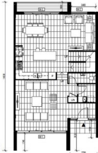
1 GA - Ground Floor plan Albert C_F1 Scale 1:100