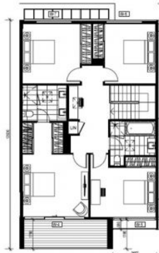
2 GA - First Floor Plan Albert C_F1 Scale 1:100