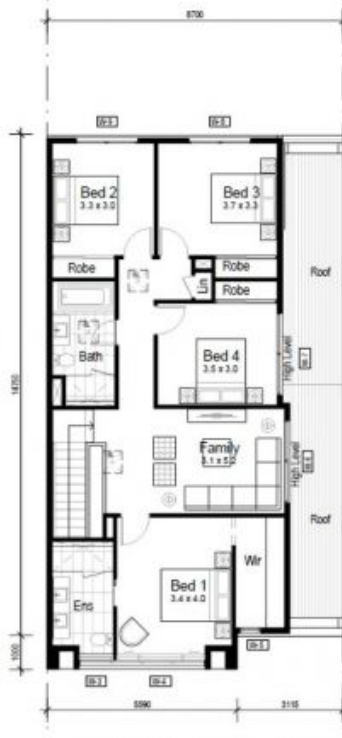
2 GA - First Floor Plan (no Notch) Scale 1:100