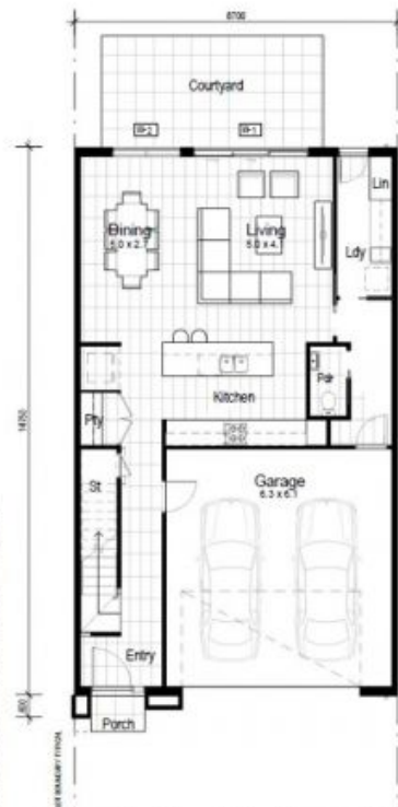
1 GA - Ground Floor Plan (no Notch) Scale 1:100